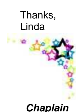
This is the day the Lord has made!

Now is the time to decide what you are going to enter into the Association of the Arts contest. I know each of you have a special gift, so get with it and get those great ideas going so we will have a wonderful display at State Convention in 2010. Everyone needs to see how talented and diverse our ESA ladies are.