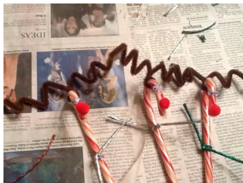
We made some tray favors for Life Senior Services. Funny reindeer