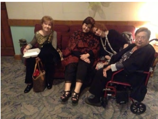
Exhausted after a wonderful dinner and installation ceremony.