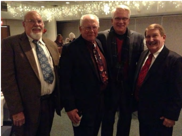
Handsome men of ESA