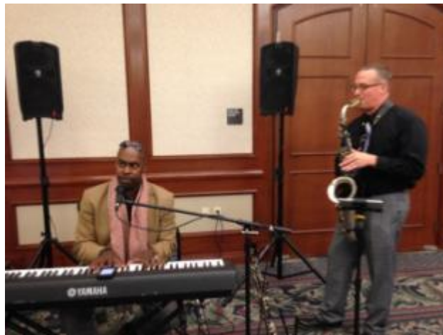
All that Jazz --a Smashing Success!!