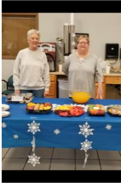
Snowflake party for the lady Veterans at the VA Center