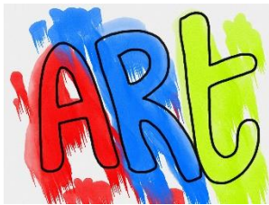
Association of the Arts