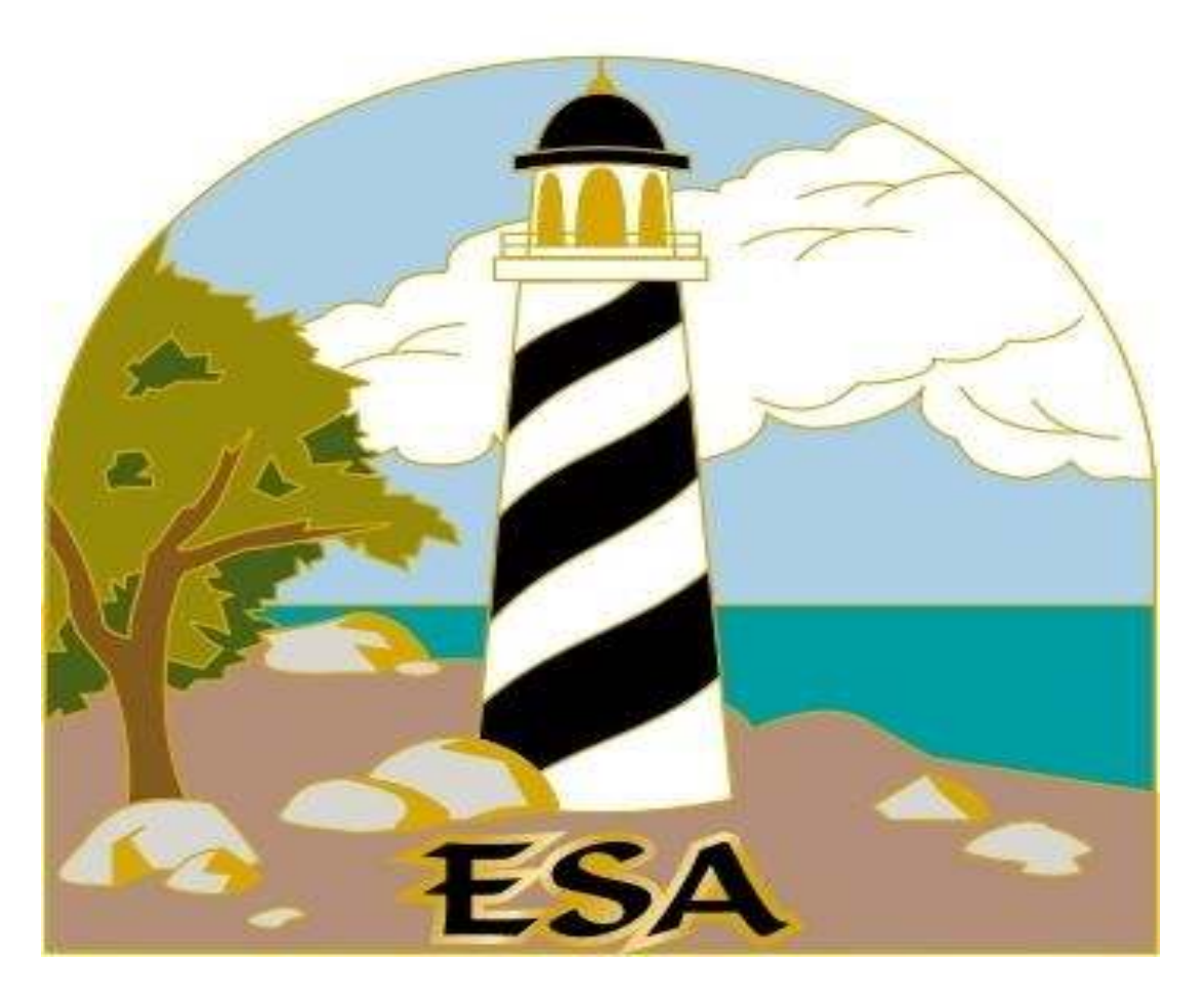
"Light Your Path to ESA's Future"