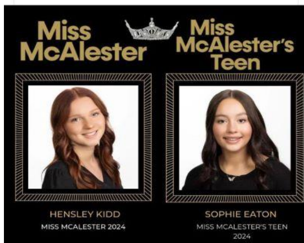
Miss McAlester Pageant Winners