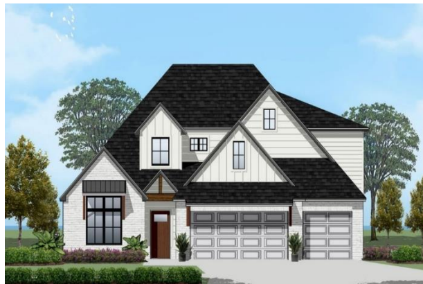
St. Jude Dream home in Edmond