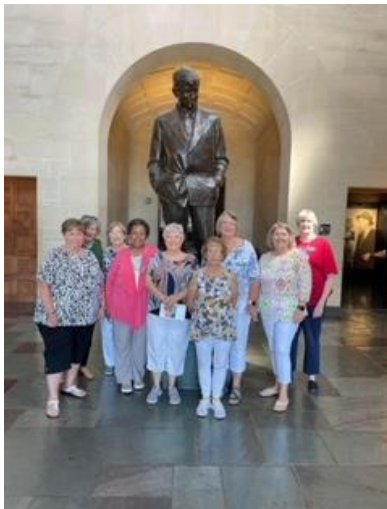
Will Rogers Museum