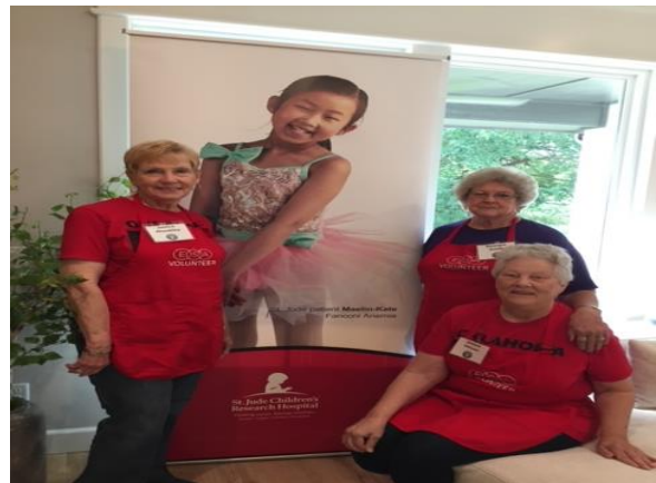
Working the St. Jude Dream home