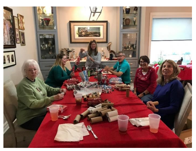
Making Christmas favors