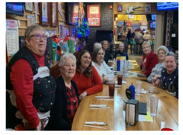
Delta Kappa Christmas gathering